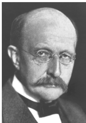
Max Karl Ernst Ludwig Planck [1858-1947]

It was then that Dr. Planck had a flash of insight and threw in a suggestion that seemed so crazy that he refused to believe it himself. [see GAMOW: THIRTY YEARS THAT SHOOK PHYSICS: The Story of Quantum Theory ; Dover Publications, NY, 1985 (republication of Doubleday, NY, 1966); p.36]